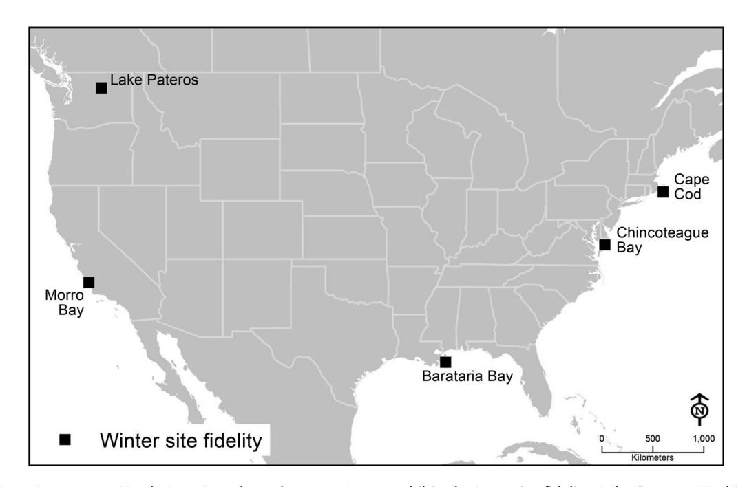
FIGURE 2. Locations across North America where Common Loons exhibited winter site fidelity: Lake Pateros, Washington; Morro Bay, California; Barataria Bay, Louisiana; Chincoteague Bay, Maryland; and Cape Cod, Massachusetts, USA.

Lake Pateros, Washington. Common Loon winter surveys occurred annually at Lake Pateros (48.08°N, -119.75°W) from 2000 to 2012. Created in 1967, Lake Pateros is a freshwater reservoir on the Columbia River, approximately halfway between Seattle and Spokane, in the middle of the state (Figure 2). From October through April, surveys were conducted opportunistically from shore using binoculars (8 \times ), a spotting scope (20 \times ), or a digital camera (Canon 7D with 400 mm telephoto lenses) and took 1.5-2.0 hr to complete. The lack of consistent resight effort led us to exclude this site in the subsequent mark-recapture analysis. From 1995 to 2013, 101