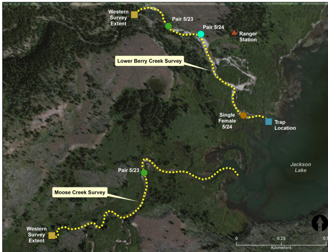
Figure 6. Harlequin breeding stream survey extent and harlequin duck sighting locations.

We surveyed a total of 2.12 km of stream shoreline among Lower Berry Creek and Moose Creek, 0.8 km and 1.32 km, respectively. We identified a total of five Harlequin Ducks (2 pairs and 1 single female) between the two streams. A breeding pair and a single female were observed on Lower Berry Creek and a pair on Moose Creek (Tables 1 and 2).