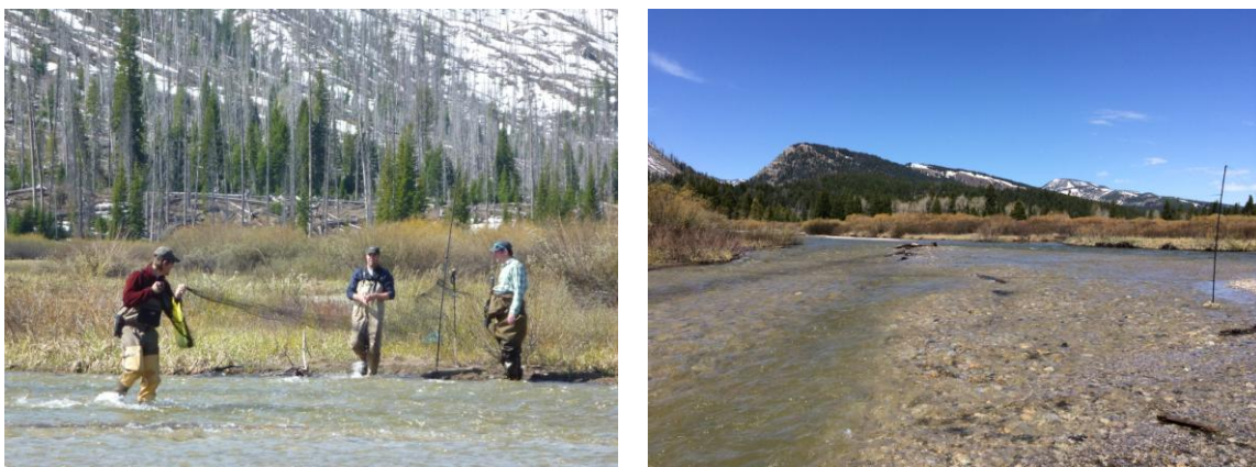
Figures 4 and 5. The field team stretching a mist net across a stream to capture Harlequin Ducks.

When a Harlequin Duck was observed, we scouted sections of the stream above and below to look for an adequate location to trap the bird. Harlequin ducks were trapped using a 100mm mesh, 12 or 18-meter long, 4-panel mist net (Avinet Inc.). The net was stretched across the stream and secured with a pole and guy lines at opposite ends (Figures 4 and 5). Two people remained hidden at each end of the net, while 2-3 people walked the shorelines of the stream to flush the ducks into the net. Netted birds were immediately extracted from the net, banded, measured, sampled, and released unharmed near the location they were initially observed prior to capture attempts.