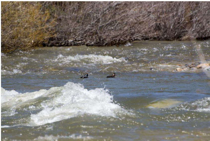
Figure 7. A pair of Harlequin Ducks on Lower Berry Stream.

Historic Harlequin Duck breeding pair surveys on GTNP streams by park biologists have been sporadic, due to funding. Ground surveys were conducted in 1985 and 1986 (Wallen 1987) and again in 1993 (Wallen 1993), as part of a harlequin population and breeding stream habitat study. In more recent years, the WGFD have conducted aerial surveys of historic harlequin breeding streams via helicopter every 5 years to fulfill objectives in the State Wildlife Action Plan for this species (WGFD 2010). Helicopter surveys were conducted in 2002, 2007, and 2012 (Oakleaf and Patla 2012). WGFD intends to continue helicopter surveys every five years. These surveys provide the only consistent harlequin breeding pair monitoring effort for the park. Additional surveys are occasionally conducted, when funding is available for such efforts.