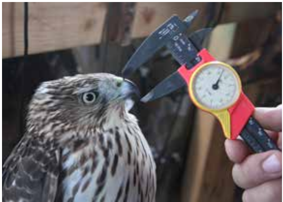
Top: A juvenile male Peregrine Falcon wears a 12 g solar satellite transmitter. Few efforts have been previously made to track young falcons during migration. One male peregrine tracked from Block Island travelled approximately 2,100 mi (3400 km) to Colombia in just over one month. Bottom: We collect standard measurements on all raptors captured. For some species, like this Cooper's Hawk, measurements confirm the gender of individuals.