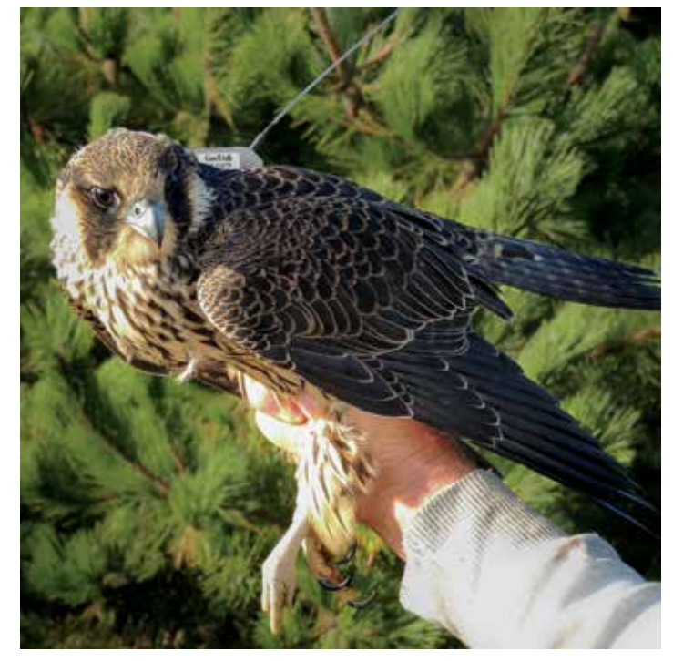
A juvenile female Peregrine Falcon wearing a satellite transmitter.

By banding birds and capturing birds banded elsewhere, we have linked raptors captured on Block Island to Massachusetts, Vermont, Assateague Island Maryland, and Cape May New Jersey. Peregrine Falcons fitted with transmitters on Block Island were successfully linked to wintering areas throughout the Caribbean and Central and South America. After their first winter, several