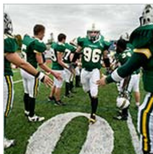
A Year of Toil and Sweat, Then They Played