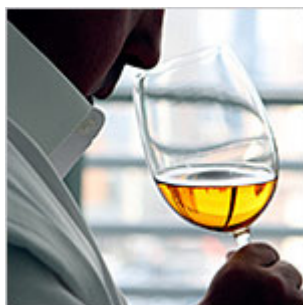
Highland Friends to Warm the Night