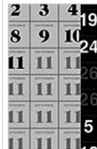
Op-Ed: India's 9/1: Exactly