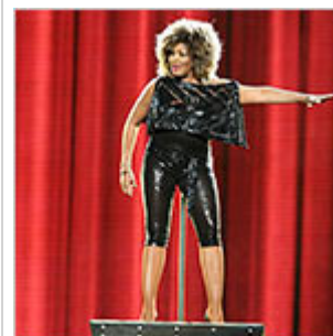
Still Proud, Still Kicking, Still Nice and Rough