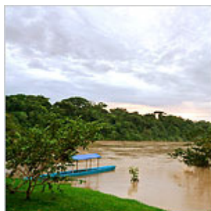
Eco-Farmers in Soggy Las Guacamayas, Mexico